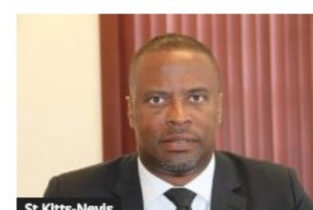
St Kitts-Nevis Ruling party wins Nevis election; Brantley to be sworn in as premier