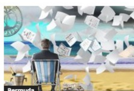
Bermuda Offshore law firm goes after British press in Paradise Papers hack