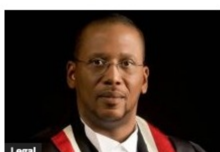
Legal More trouble ahead for Trinidad and Tobago chief justice as Law Association considers impeachment