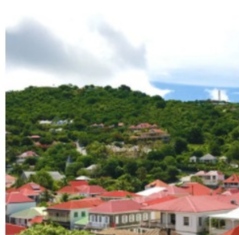
The Caribbean's Prettiest Towns