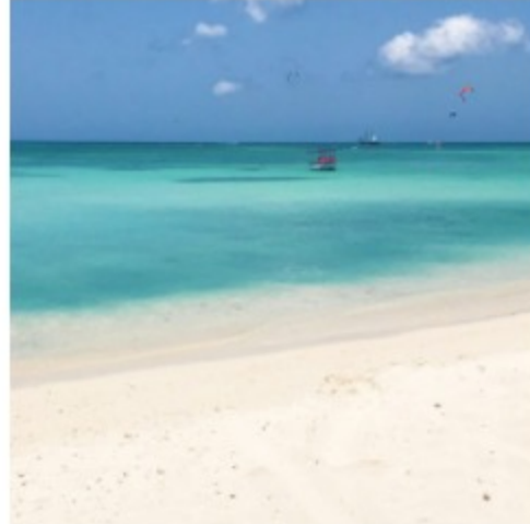
Editor's Note: The Caribbean, After Irma