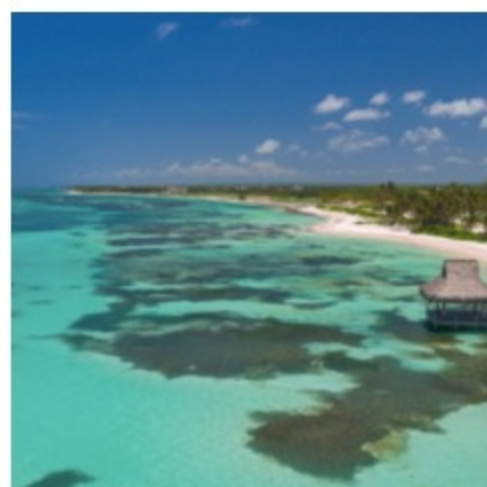
5 Punta Cana Resorts to Visit Right Now