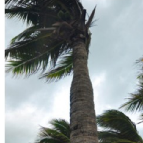
St Martin, St Barth Pummeled by Irma