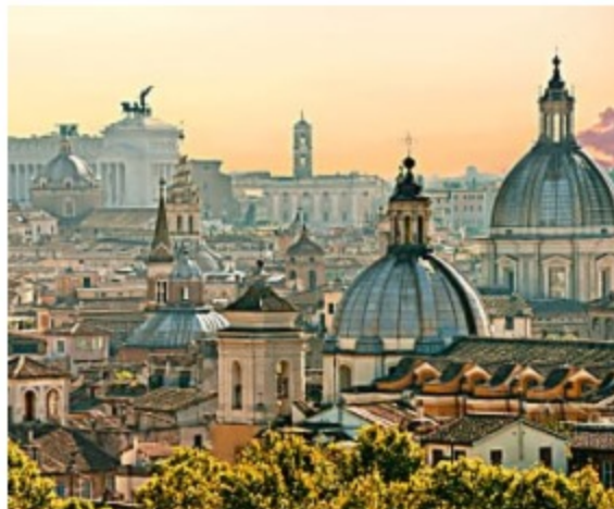
Italy outlaws hotel rate parity | Hotel Management