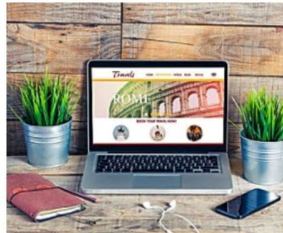
Technology is key to driving revenue at hotels | Hotel Management