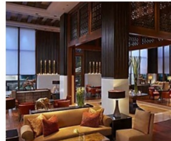
7 brands that should be on your radar | Hotel Management